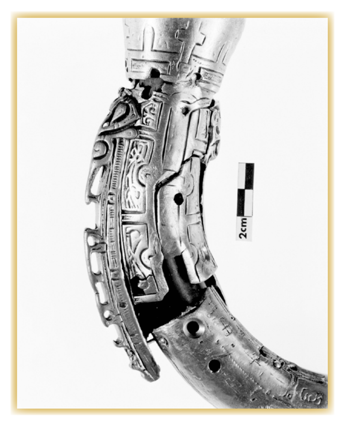
Twelfth-century Kilmore Crozier

At the Cathedra, Bishop Martin exchanges the Sign of Peace with members of the College of Bishops, demonstrating his communion with them and the communion of the Church of Kilmore with the universal Church.