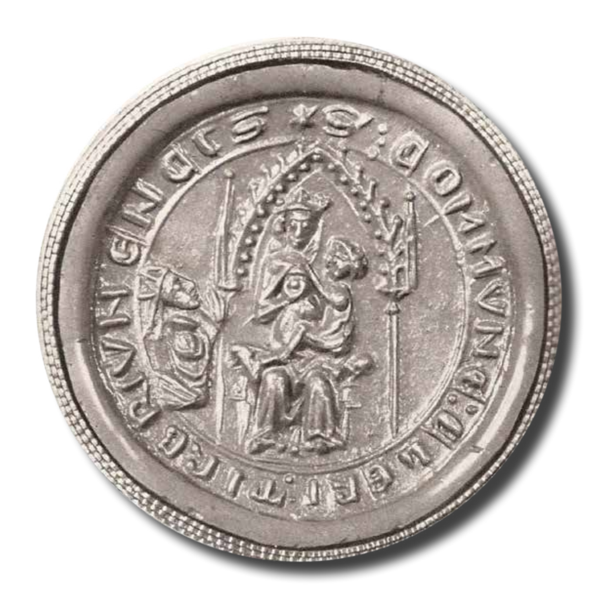
Fourteenth-century seal of the clergy of Kilmore