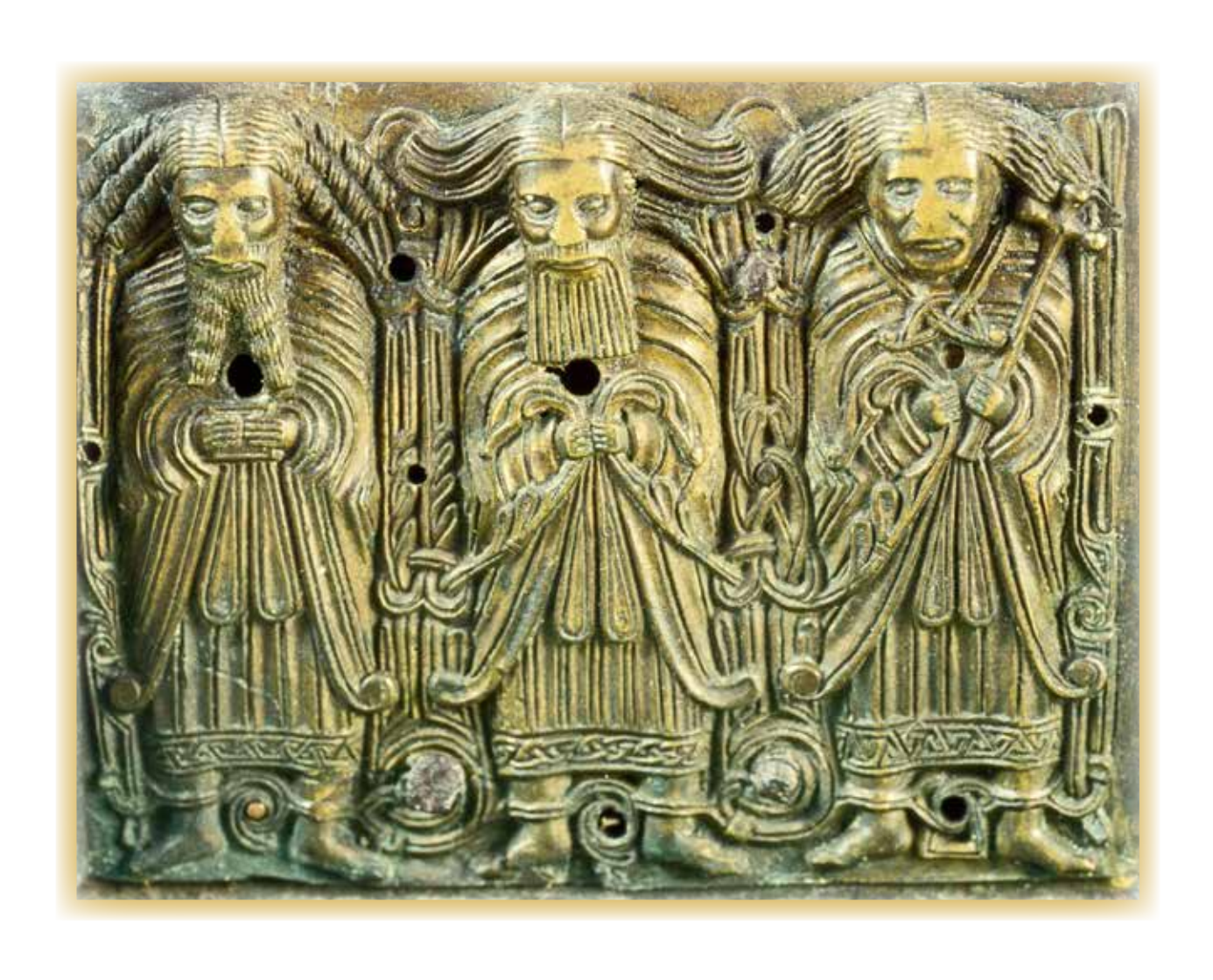
Detail from the Breac Maodhóg reliquary which was created c.1100 and held at Drumlane